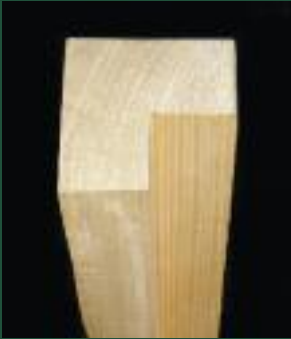
Square Timber Corner