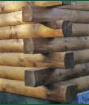
* Full Tail Corner

* These corners are manufactured by gluing and fastening a square timber to the log siding profile to give the appearance of a full log butt and pass corner system. There is a ten year warranty against separation as long as they have been properly maintained and the home has a two-foot over hang or more.