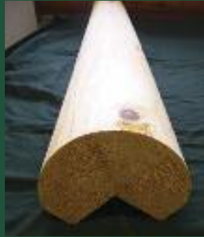
V Notched Corner Log